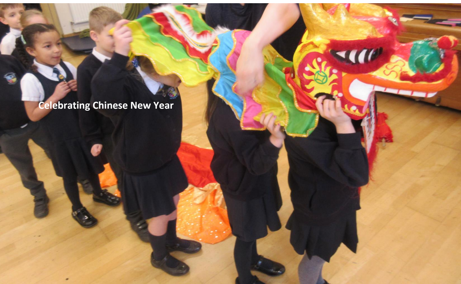
Celebrating Chinese New Year

Staff use an overview of the academic year to plan different subjects. Significant events in the school calendar such as Harvest, Diwali, Mother's Day, Easter and Christmas are incorporated into the curriculum. We aim to make as many links between subjects as possible through a creative curriculum and make the most of learning opportunities through the year and these are set out in the plan. Planned cross-curricular themed weeks focus on a particular aspect of learning or subject area in a fun and engaging way. For example, 'Science Week' and 'Book Week'. These make as much use of our wonderful outdoor areas as possible.