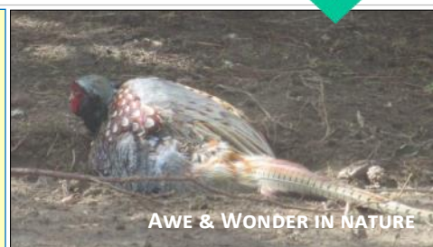
AWE & WONDER IN NATURE

This week we had the most amazing moment of Awe and Wonder when we saw a pheasant in the Peace Garden. She had burrowed herself a hole in the middle of the garden and it looked like she might lay her eggs there (we did some 'googling', and apparently this is something they do before laying their eggs). She later disappeared after having had a delightful dry mud bath. We will let you know if she is spotted again.