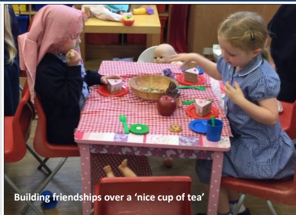
Building friendships over a 'nice cup of tea'

An important aspect of children's personal, social, and emotional development (PSED) is to "learn how to make good friendships, co-operate and resolve conflicts peaceably". These past few weeks in Busy Bees there has been a great focus on this area. PSED builds foundations for making relationships throughout life and the adults in the classroom have been supporting the children, so they can develop the social conventions of being kind to each other, sharing, and playing 'nicely' together.